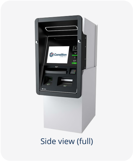
Side view (full)