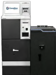
RCS800 + RCS700