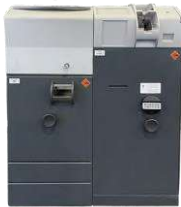
CDS803 + SDM504