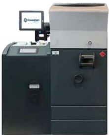
AST9000 + CDS803*