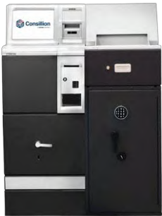
RCS800 + HCM