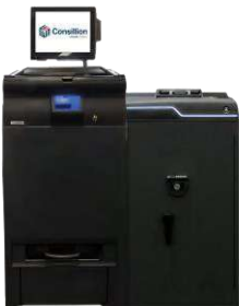
RCS402.2 + RCS700