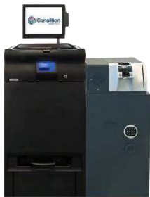
RCS402.2 + SDM504