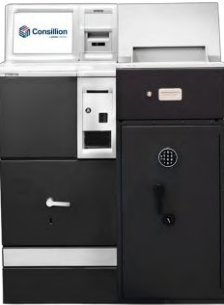
RCS800 + HCM