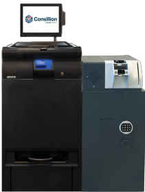
RCS402.2 + SDM504