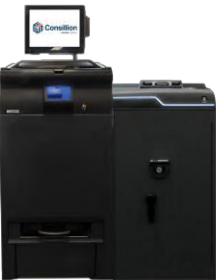
RCS402.2 + RCS700