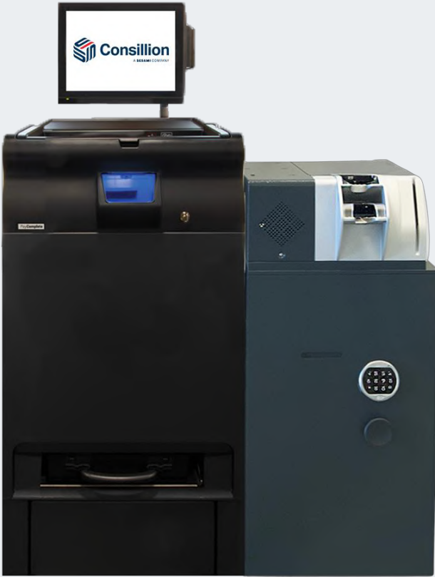
Available in S and C models.