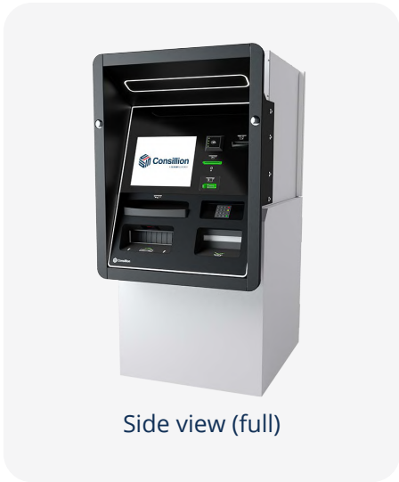
Side view (full)

* Note Dispenser installation kit also available separately.