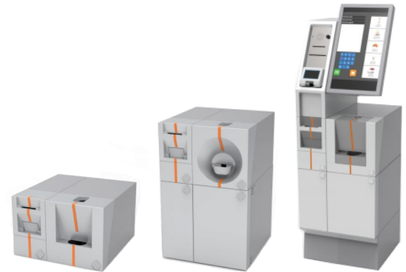
Counter top unit

The INLANE range offers a flexible note and coin capacity to suit your store needs and dimensions.