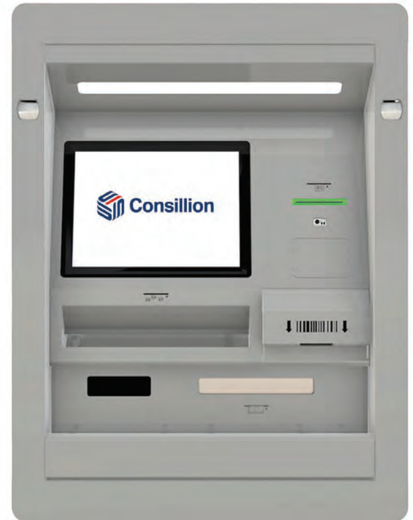
CRTi Cash Redemption Terminal

To know more about the CRTi and how it can help your recycling business, please send us an email at salesuk@consillion.com