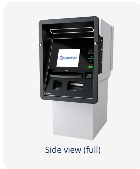
Side view (full)

*Note Dispenser installation kit also available separately.