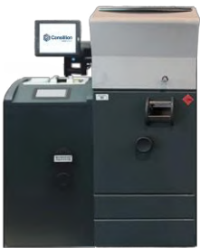
AST9000 + CDS803*