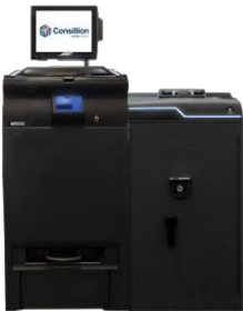
RCS402.2 + RCS700