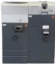
CDS803 + SDM504