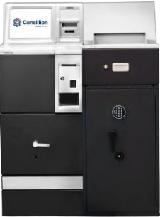
RCS800 + HCM