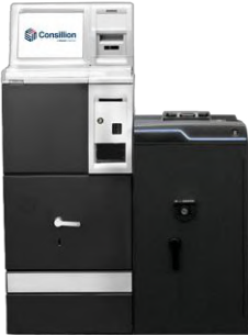
RCS800 + RCS700