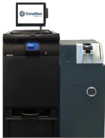
RCS402.2 + SDM504